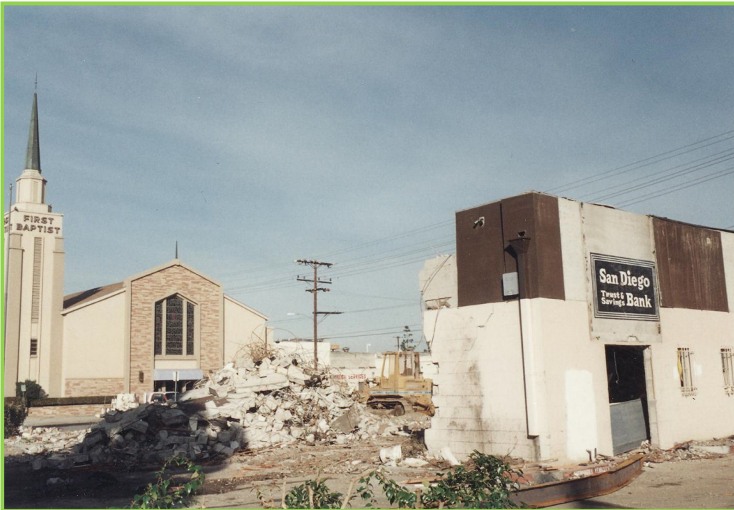
1996-Main Street Demolition of San Diego Trust and Savings Bank which would lead to the park renewal. The renaissance began in 2002.