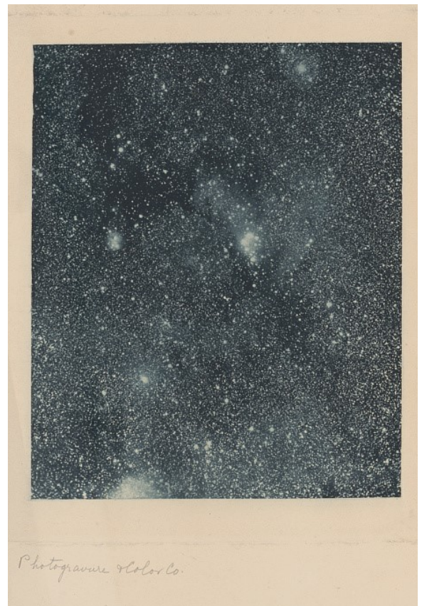
Stars, Library of Congress Image.

To create a true north/south boundary the surveyor in the dark of night set the transit over the object marking a corner or a point on line. He would then take a sighting on Polaris, or would "shoot Polaris" and then project this down to earth some distance away and set a marker. This line is the new true north.