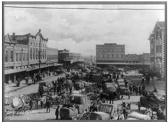
Marketing Cotton