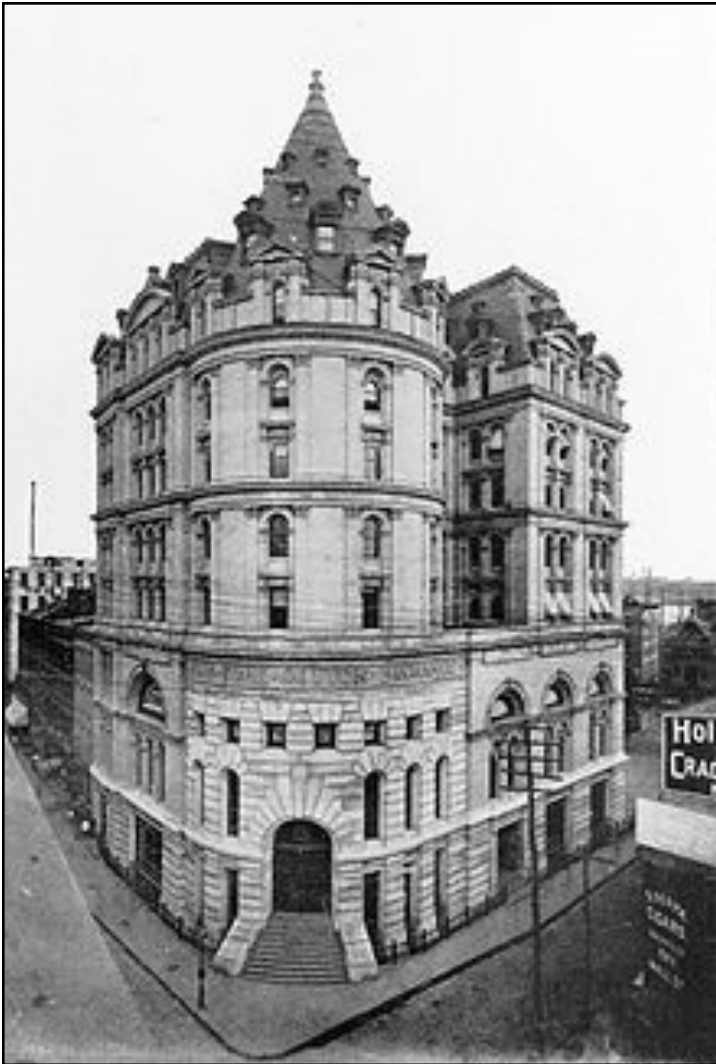
New York Cotton Exchange