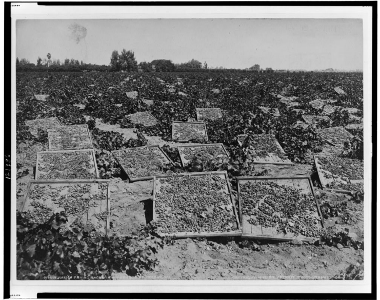
Raisin Vineyard