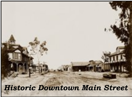
Historic Downtown Main Street

Imagine viewing El Cajon Valley from one of its western hills on a sunny afternoon almost any year between 1898 and World War II. The slowly expanding City was concentrated along Main Street between the railroad tracks on the western side and Mollison Avenue on the east. Outside the City, a patchwork of vineyards, gardens, open fields, and isolated homes blended into the green of orange and