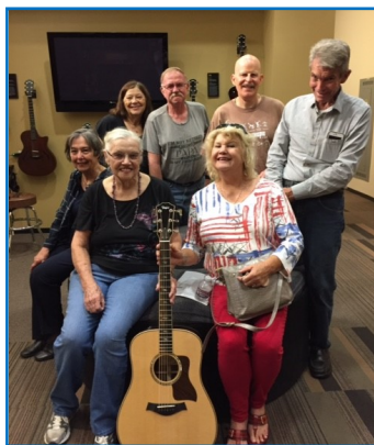
Some of our members taking in the sights-and sounds.

Taylor Guitars is located at 1980 Gillespie Way, El Cajon in the historic industrial park.