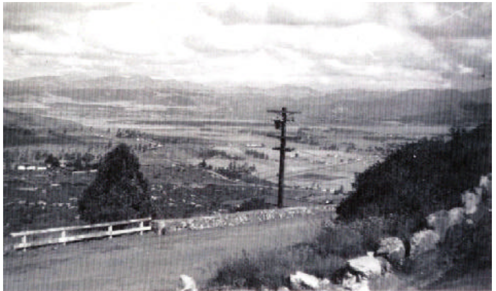
The tranquil El Cajon Valley from Mt. Helix in 1940 before it faded into “interurban bustle” after World War II.