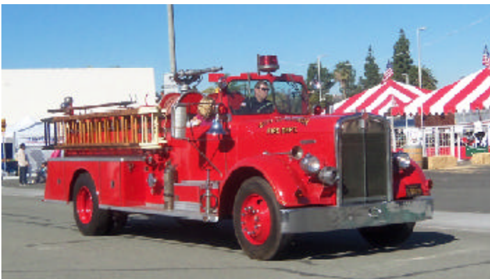
This historic fire truck paraded down Rea Avenue as part of El Cajon's Centennial. The downtown celebration was reminiscent those held in cities and towns all over the U.S. in the mid-1800s. The event was so popular it sparked the present America on Main Street annual event.