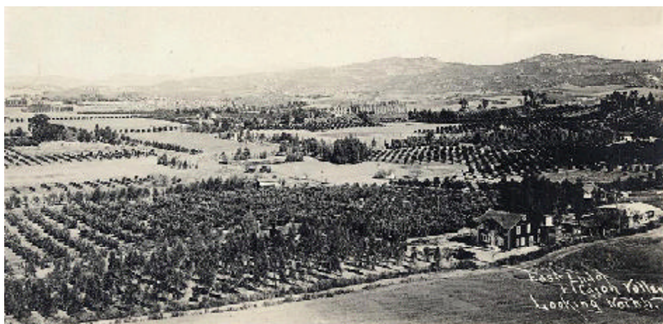
A tranquil El Cajon Valley was a "dream world" to young Carroll Rice, the east end shown here looking north in 1935.