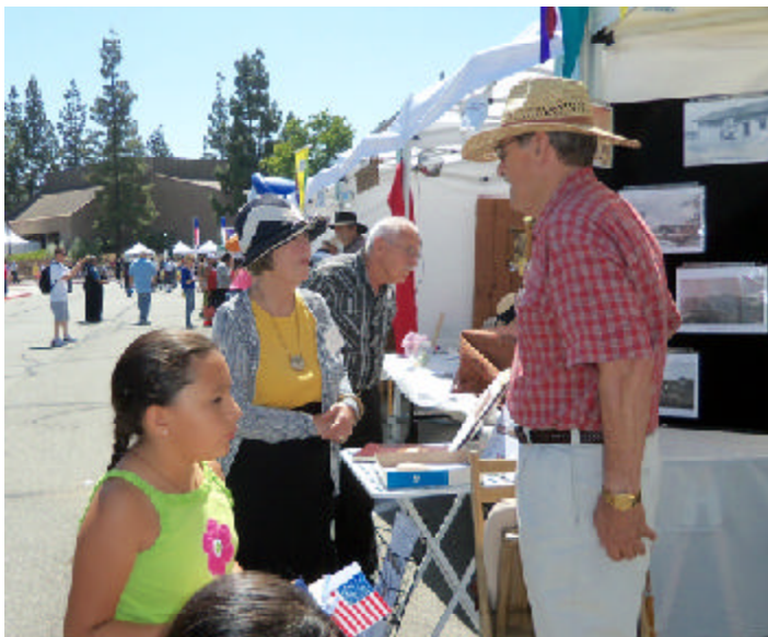
Residents of all ages enjoy this all-day patriotic event which celebrates the many diverse ethnic and historical groups in the community.