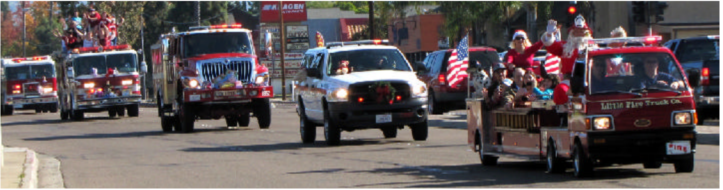
Each year the East County Toy and Food Drive culminates with a parade of real fire trucks loaded with toys for El Cajon children.