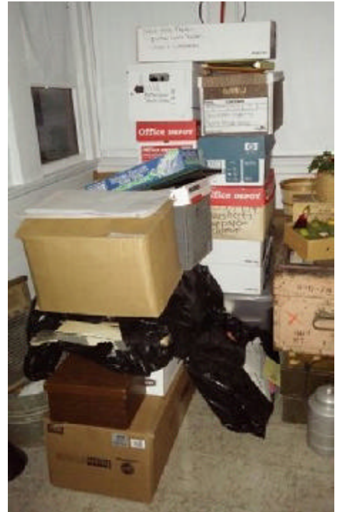
Boxes awaiting a willing volunteer!

Description: While the floats have changed, the participants have changed, and even the routes have changed, one item has remained consistent throughout the storied history of the Mother Goose Parade: In the sixty-nine showings since this eagerly anticipated family affair first traversed Main Street in 1947, the Parade has never failed to put huge smiles on the faces of young, middle-aged and elderly attendees alike! That first parade, which was assembled as a gift to El Cajon children of all ages, had an estimated attendance of 25,000 people, at a time when the entire population of El Cajon numbered around 5,000. It has grown somewhat since those early days, with parade entries from around the United States, and attendance now exceeding 400,000 people. Recently, the Mother Goose Parade Association lost its office space and had nowhere to store its archives. Fearing that the archives would become forever lost to posterity, the El Cajon Historical Society has volunteered to become the new caretaker of these archives. As the quantity of nearly 70 years of Parade records is so great, it is hoped that this stewardship will be short-lived. Meanwhile, the Knox Museum is in desperate need of a volunteer to assist with the digitizing of all of these records. Most of the work will involve scanning thousands of photographs. Please leave a message with the Museum if you would be willing to donate a few hours each week to help out.