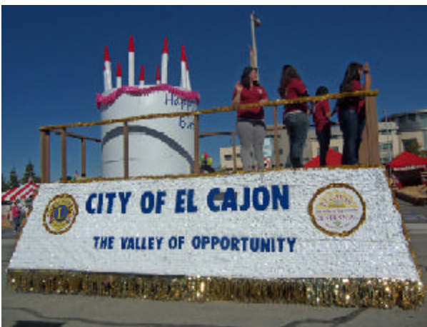
An old-fashioned parade, featuring local residents, was part of the festivities.