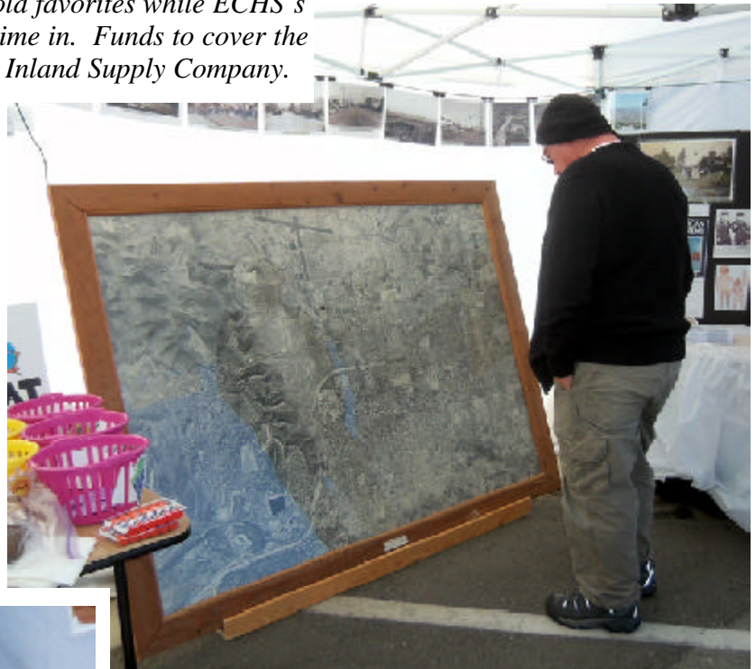
An El Cajon resident tries to locate his house on this aerial view of the city taken before the freeway was built.