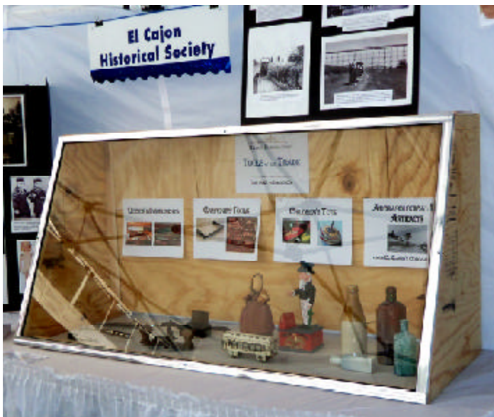
"Tools of the Trade" from the late 1800s to early 1900s were displayed including doctors' instruments, carpentry tools, children's toys, and bottles from the Corona Hotel archaeological dig.