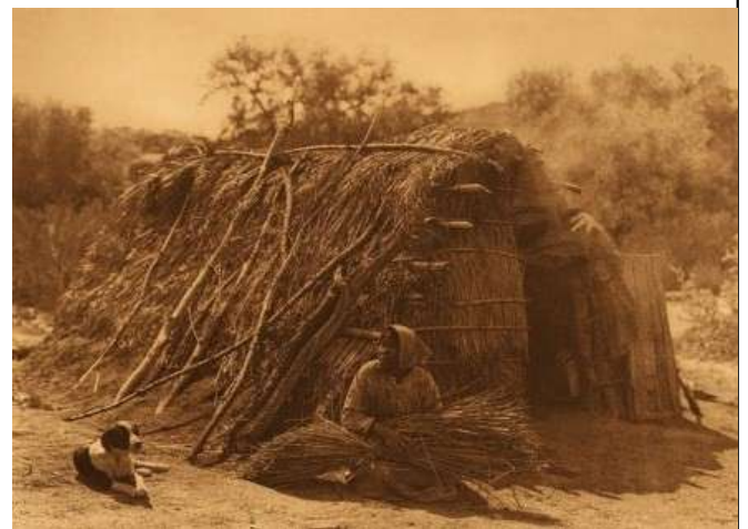
Kumeyaay woman in front of traditional choza at Campo, by Edward S. Curtis (1926) - Credit: Library of Congress

Today the Kumeyaay live in many different reservations. Kumeyaay are well known for their casinos. The money they make from the casinos helps their tribe.