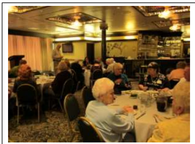
Attendees enjoyed delicious Mediterranean chicken and fish entrees at the Chrystal Ballroom, Magnolia and Wells.